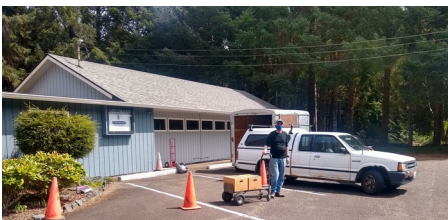
Thursday food boxes at the chapel

Thank you to our volunteers for making this happen.